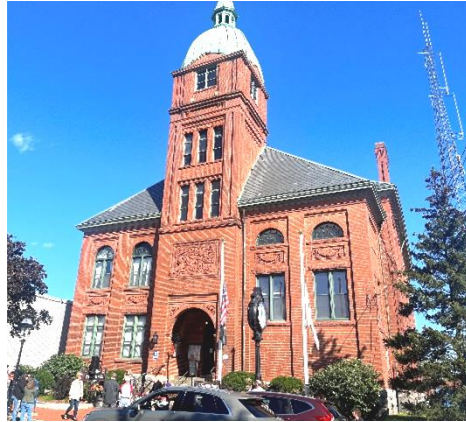
Warren Town Hall

BRIEF HISTORY: The town of Warren was first settled by the Pokanoket Indians. In 1632 Europeans established a trading post in the area with a permanent settlement following in 1653. During the mid-18th century, Warren was recognized as a leading whaling port and ship building center. When that industry declined, Warren became known for its textile manufacturing in the mid-19th century.