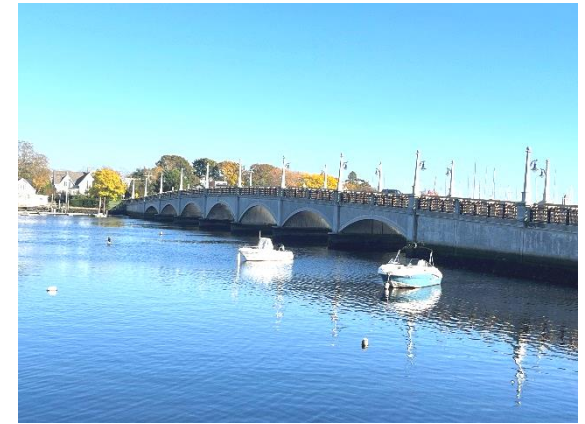
Bridge along East Bay Bike Path in Barrington

Both loops are mostly flat and on paved surfaces for an AVA rating of 1A. Trail would be doable for strollers, but might be difficult for wheelchairs due to uneven pavement in places.